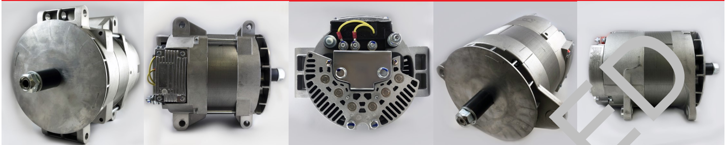
55i-300ACT-28 alternator is shown above in Pad-mount (left three photos) and J180-mount (right) versions.