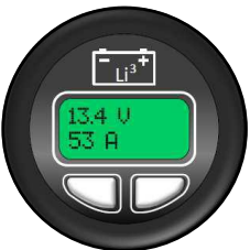
Round SOC Display

NOTE: CONTACT LITHIONICS BATTERY® FOR A USER INSTALLATION GUIDE & STORAGE PROCEDURES. FOLLOW THE GUIDE TO ENSURE FITNESS OF USE & WARRANTY.