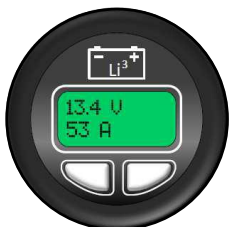
Round SOC Display

NOTE: CONTACT LITHIONICS BATTERY® FOR A USER INSTALLATION GUIDE & STORAGE PROCEDURES. FOLLOW THE GUIDE TO ENSURE FITNESS OF USE & WARRANTY.