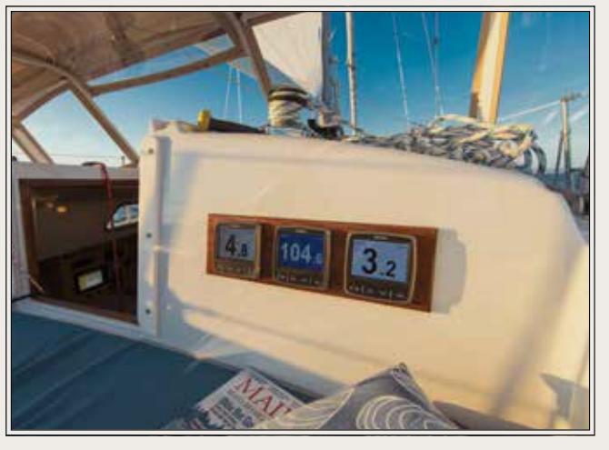
For the sailing instruments, I was able to refurbish and use the old teak mounting plate (left). I put on the stickers Raymarine supplied to see what would go where, and I ended up having to drill the holes a bit bigger. Otherwise, everything came together quite easily, and we now have nice, big cockpit displays for wind speed, depth and boat speed (right).